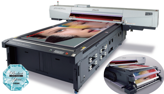
Optional Roll Unit